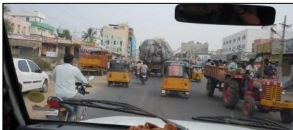
You never know what you will see on the road.