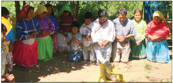
The Huichol kneel in a prayer of thanks for God’s blessings.