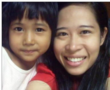
Sister L & a girl she is teaching songs

Ziouv Gengh Longx Haic "God is So Good" http://youtu.be/Z6aNkebdyQM