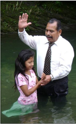
Your help brings joy to young and old alike in south Mexico, opening the door for eternal life in God's Kingdom!