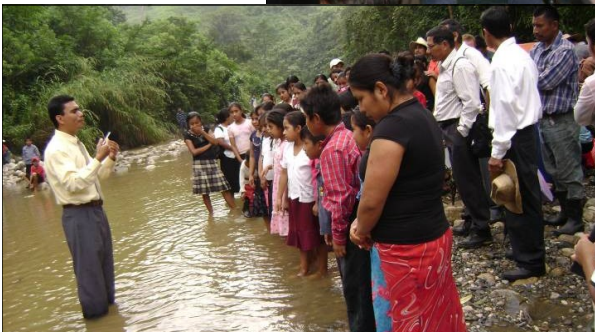
Dozens are baptized as a result of our devoted teachers.