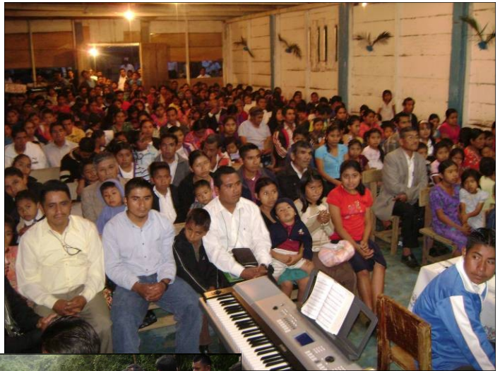
Students lead out in evangelistic meetings, attended by hundreds.