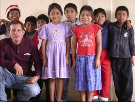
Indigenous children who attend our school appreciate Christian teachers who teach them about Jesus instead of getting drunk.