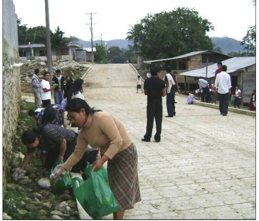
Picking up trash & visiting homes give a positive impression.