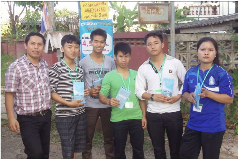
Sulads Thailand, stories pg 5-7