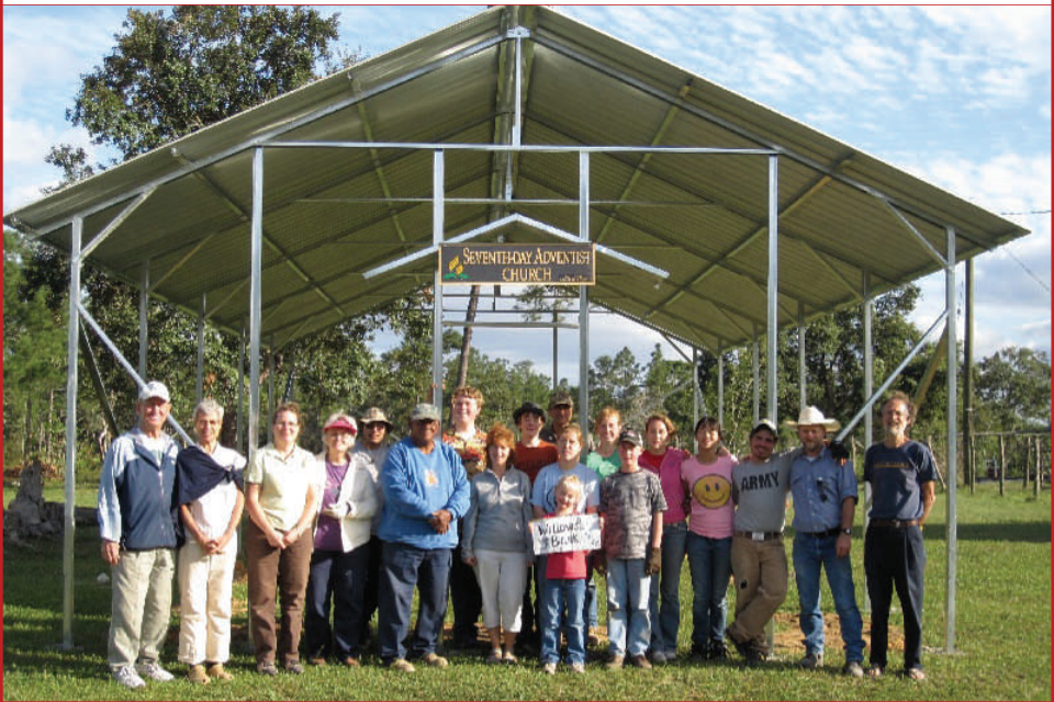
New Church in Willows Bank, outside of Belize City.