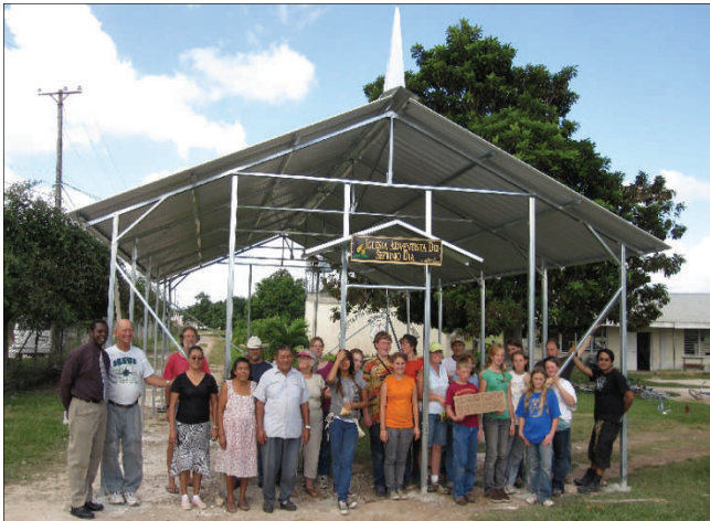
Chapel for the high school in Calcutta