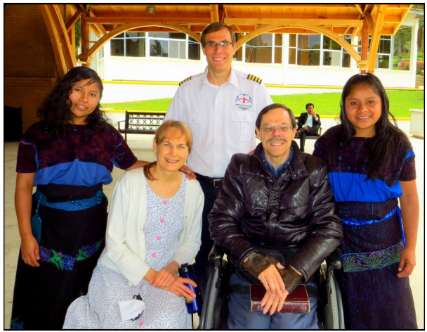
funds - we just made sure they got to the right place. So they send you their most heartfelt thanks.

While there, I discussed Worthy Student Aid and the San Lorenzo School with the folks in charge, and things are looking very good. Time after time young people threw their arms around us, thanking us for making it possible for them to complete their studies. We had to keep reminding them that it is the donors provided the