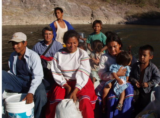
SDA Huichol taking their children to school across Lake Presa Aguas Milpas