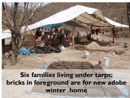
Six families living under tarps; bricks in foreground are for new adobe winter home

The village is a settlement of six families with school-aged children, living under 16X36 ft. plastic advertising banners. The families are making adobe bricks from the clay soil, each having a nice big pile of bricks ready to start building their winter