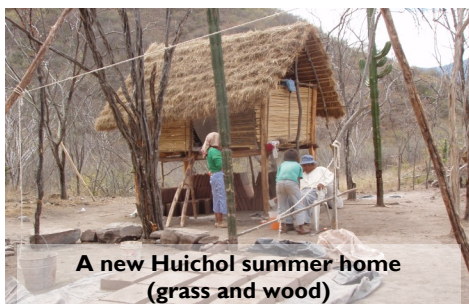
A new Huichol summer home (grass and wood)