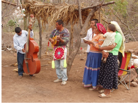
SDA Huichol in new village, Agues Frias, making Sabbath music

When we arrived Aguas Frias on Sabbath, the families were in the middle of their church service. Since some of the elders don't speak Spanish, much of the services were led in Huichol language. One of the relocated men is in his 90's. Imagine starting all over in an inhospitable environment, with no conveniences or the comforts needed at that age!