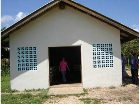
Seventh-day Adventist Church in Buena Vista, Belize