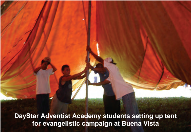
DayStar Adventist Academy students setting up tent for evangelistic campaign at Buena Vista