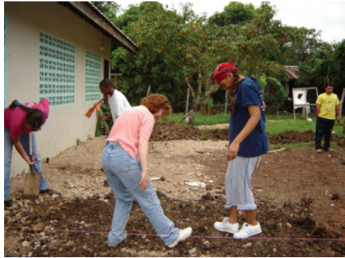
DayStar group pre- paring ground for an addition to church above