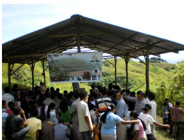
(This is Hillside SDA Church, also a daughter of PaoPao SDA Church.)

Winnie is assigned in Talambong to lead the worship. Good news: the church building, Mt Gerizim, in Talambong, is almost done with light materials only. It is very far and it's hard to build a concrete block