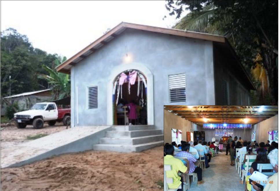
Thank you Sunnyside Church, Portland, OR! Story pg 3